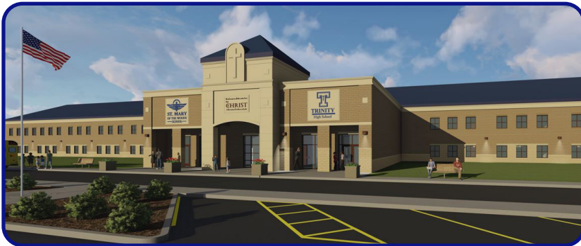
Here is what the front façade of the school could look like.

Here are a few of the architectural renderings of the proposed new schools