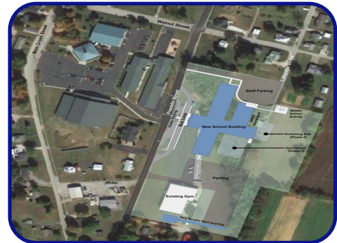
Here is an overview of where the school would be located.